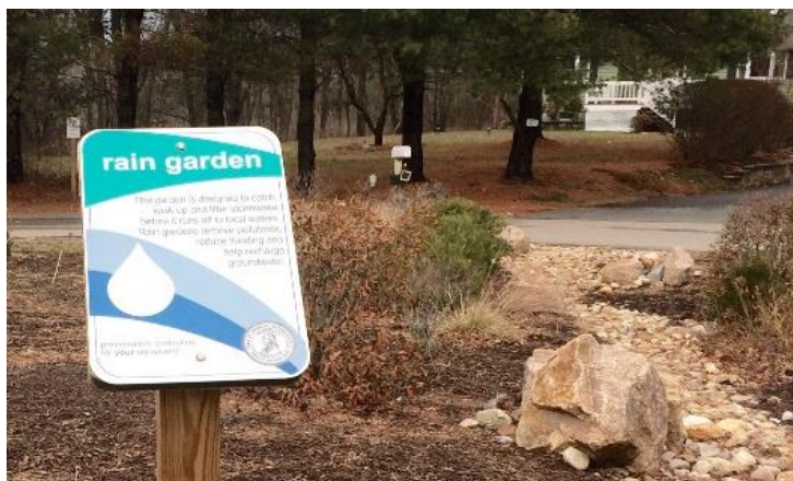
Anchorage Road rain garden

How: Use of green infrastructure is standard operating procedure for the Franklin DPW. Public outreach, including signage at project locations and education in the schools, has been key to developing and sustaining public support. The DPW has been entrepreneurial in pursuing grant support for green infrastructure projects. In the past decade, they have received nine grants from state, federal and private sources, totaling just over $1 million for projects, planning, and analysis.