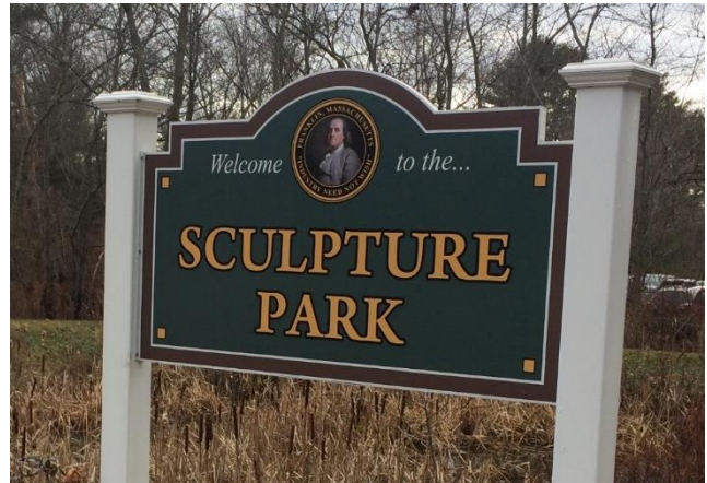
Sculpture Park, Panther Way

The Sculpture Park is a unique and beautiful park that happens to provide stormwater treatment for an adjacent four-hundred unit condominium complex that previously had no stormwater treatment. The town-owned site sits along Mine Brook, which is a major tributary of the Charles River. In the 1930's, as part of a WPA project, the dam was constructed to create a town swimming pool. Use of the swimming pool was discontinued in the 1970s and the pool became overgrown with trees.