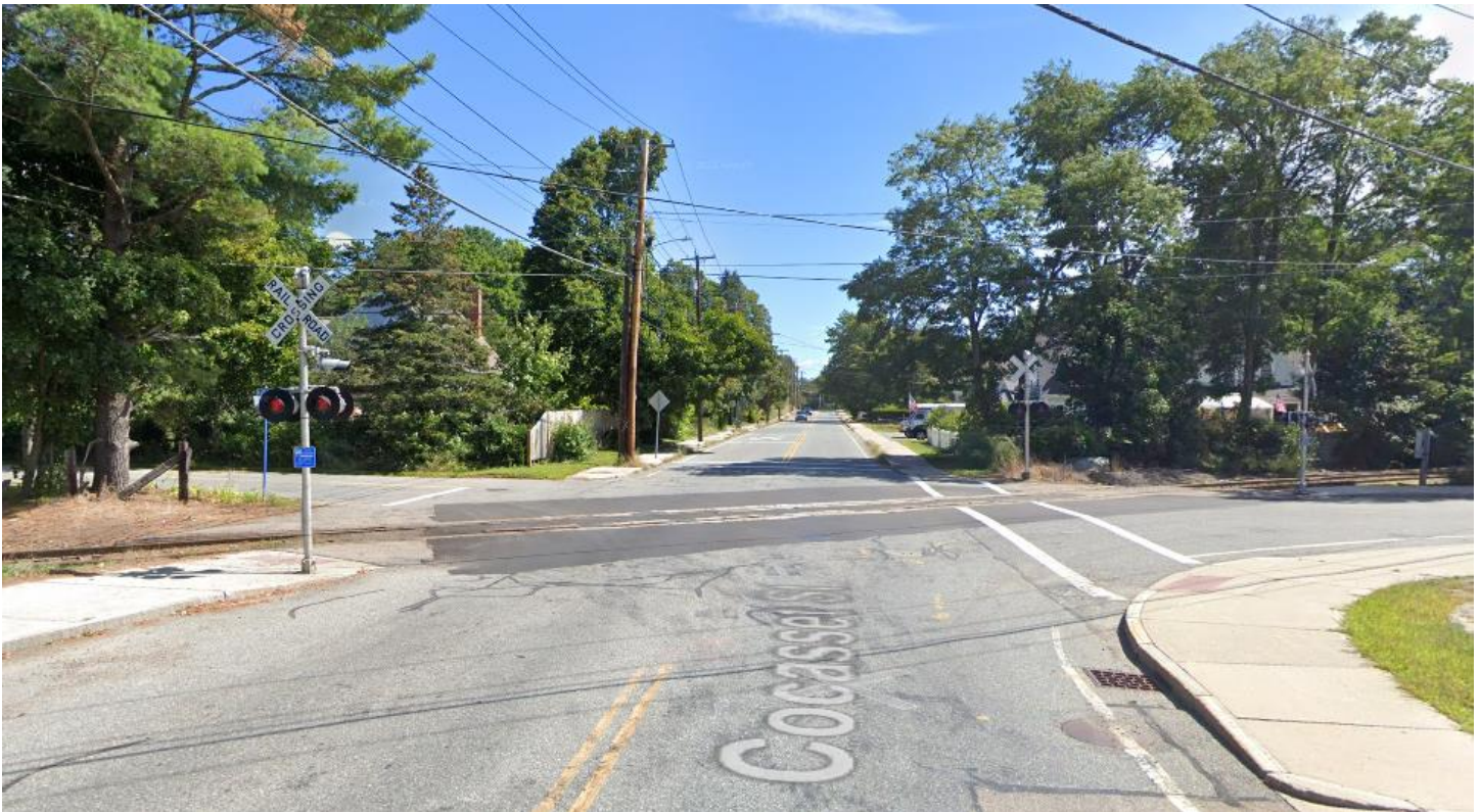
Figure 1. Cocasset Street railroad crossing looking east.